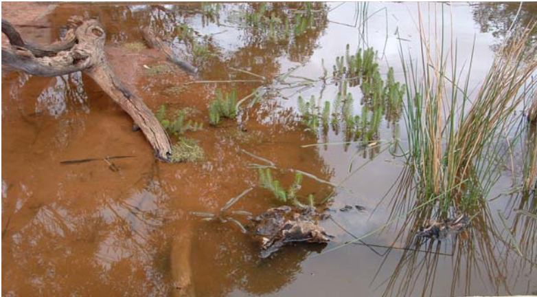
Logs, branches and aquatic vegetation in a wildlife pond providing habitat for fauna.

“Wildlife ponds will provide their maximum biodiversity benefit when planted with aquatic vegetation...”