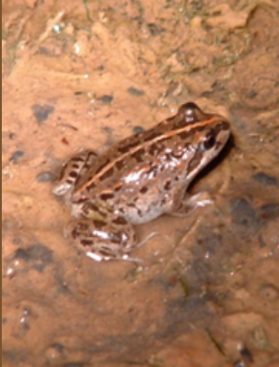
Spotted Marsh Frog at a farm dam near Birchip.

"An ideal site for a wildlife pond has at least one hectare of native vegetation, no stock access and a piped water supply nearby."