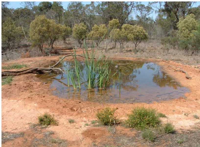
Wildlife pond in a patch of native vegetation near Culgoa, with aquatic plants establishing.

Installing a wildlife pond on your farm can be an efficient and cost-effective way of enhancing wildlife values in the Wimmera and Mallee within a piped water delivery system.