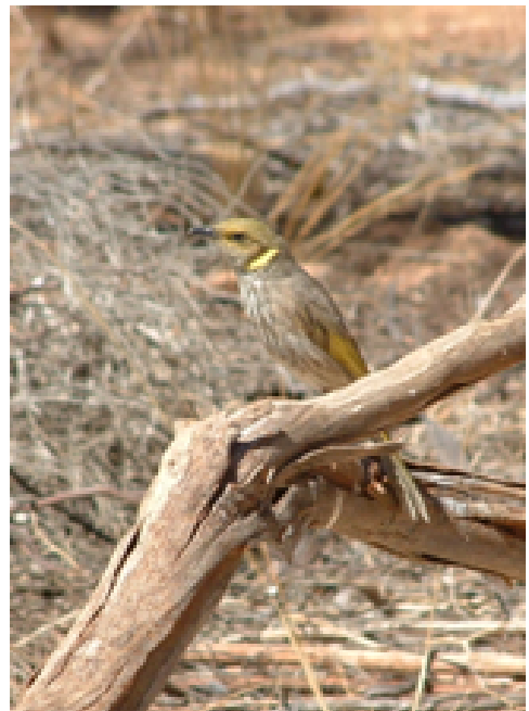
Yellow-plumed Honeyeater coming down for a drink.

An ideal site for a wildlife pond has at least one hectare of native vegetation, no stock access and a piped water supply nearby. Smaller patches could be used and enlarged by planting additional local native species.